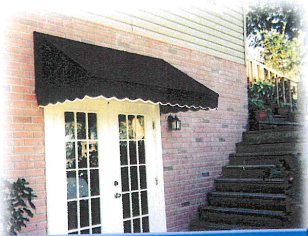
Residential & Commercial